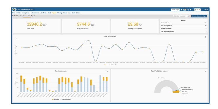
FleetUp Professional Dashboard Reports enables you to optimize fleet operations and reduce operating costs